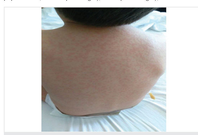
Figure 1. Maculo-papular rashes are seen in the back of our patient

his physical examination, his general condition was good and he was conscious. His vital signs were as follows: body temperature: 38.2 °C, pulse: 125/min and blood pressure: 90/60 mm/Hg. The patient had new-onset maculo-papular rash on his face and whole body (Figures 1,2). Facial rashes and peelings on the palm and fingers suggested HPV-B19 infection, however, dermatitis in the DRESS syndrome was also suspected (Figure 3). Physical examination also revealed diffuse maculo-papular rash, 2 cm hepatomegaly, 3 cm splenomegaly, bilateral cervical