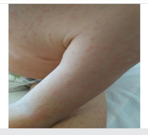
Figure 2. Maculo-papular rashes in the trunk, arm and thigh