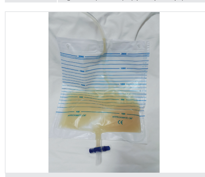
Figure 1. The chylous fistula volume from the subhepatic drainage varies between 600-1800 cc per day

Sensitivity of the lymphatic tissue to radiation is known. It is known that chylous acid may develop due to radiotherapy. On the other hand, it is also known that edema occurs in the lymphatic tissue primarily, followed by narrowing of the canals and decrease in lymphatic tissue size. There are very few publications in the literature on this subject (1,6,14-18). Dietl et al. (14) achieved successful results with low-dose radiotherapy in refractory lymphorrhea after vascular interventions in the inguinal region. Habermehl et al. (15) reported similar results. In the literature, there are studies reporting that chylous acides due to celiac lymphoma is treated by radiotherapy (14). It was reported that chylous fistula developed after gastric cancer surgery with D2 dissection was successfully treated with low-dose radiation (15). The largest series