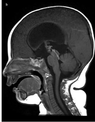
Figure 1. a) At Sagittal T1WI, isointens multilobulated mass, located at the base of third ventricle and extending down along the aquaductus cerebri b) After administration of contrast medium, heterogeneous enhancement was noted