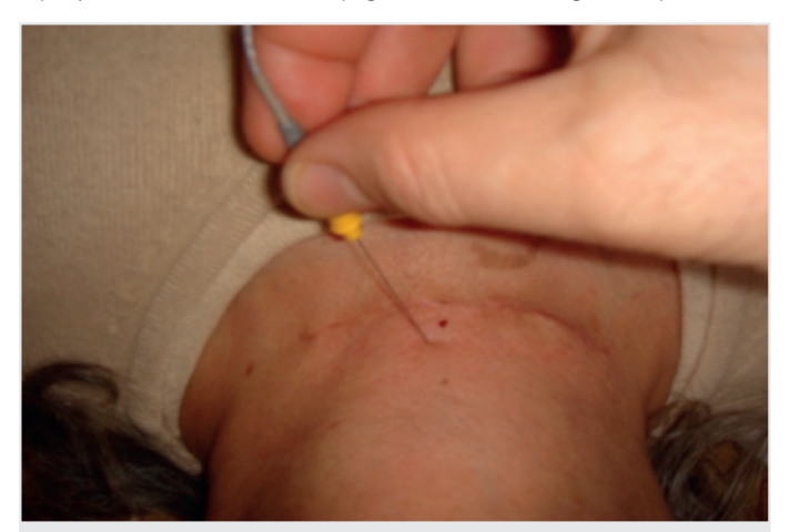
Figure 4. Insertion of the needle electrode into the cricothyroid muscle for the evaluation of superior laryngeal nerve function in a patient who underwent postoperative electromyography

The function of EBSLN was evaluated by laryngeal electromyography (EMG). Recordings were performed before and after surgery in all patients, and bilateral cricothyroid muscles were examined. Preoperative muscular pathologies were investigated and repeated after one month because of abnormal spontaneous discharges. Before the control EMG, the patients were questioned in terms of phonation disorders (hoarseness, loss of strength of the voice, vocal fatigue and inability to achieve high pitch tasks). Neuropack MEB-9102K (Nihon Kohden, Tokyo, Japan) device was used for laryngeal EMG. Recordings were performed