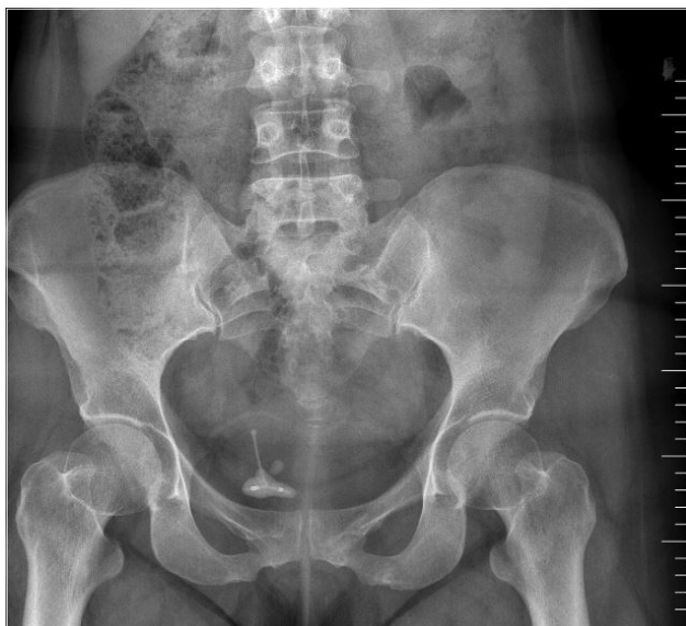
Figure 1. Encrusted intrauterine contraceptive device in the pelvic area. Plain abdominal radiography image.

Depending on the location of the device and the potential involvement of adjacent organs, there are many ways to retrieve an IUCD (10). In the present case, we performed an endoscopic approach and fragmented the stone by laser lithotripsy. There was no complication on performing the procedure, and the patient's complaints resolved.