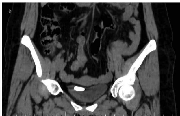
Figure 2. a, b. Image of the intrauterine contraceptive device that migrated to the bladder and the stoned device on performing computer tomography (a: axial section). Image of the intrauterine contraceptive device that migrated to bladder and the device on performing computer tomography (b: coronal section).