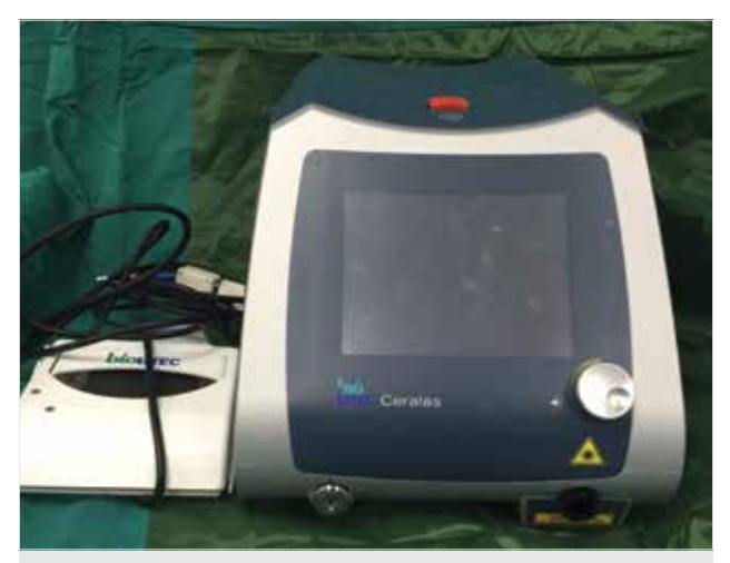
Figure 1. Diode laser (30 W, 980 nm) (Biolitec Ceralas, Bonn, Germany)

The population comprised 42 males (97.6%) and 1 female (2.4%), ranging in age from 41 to 83 years (mean, 61.4). The follow-up period ranged from 5 to 83 months, with a mean follow-up period of 31 months. The cordectomy types of the 43 laser cordectomies performed were type II (subligamental) in 8 patients, type III (transmuscular) in 10 patients, type IV (total) in 7 patients, type Va (extended to the anterior commissure and contralateral cord) in 7 patients, type Vb (extended to the arytenoid) in 2 patients, type Vc (extended to the supraglottic area) in 7 patients, and type Vd (extended to the subglottis) in 2 patients (Table 1). None of the patients required tracheotomy in their surgeries. Five (11.6%) patients experienced local recurrence within periods varying from 13 to 81 months (mean=28). Three (7%), 1 (2.3%), and 1 (2.3%) recurrences referred to the T1a, T1b, and T2 TNM stages, respectively. One case was a tumor involving both the anterior commissure and vocal cord, 2 cases were carcinomas involving the anterior commissure, and 2 cases were carcinomas involving the arytenoid (Table 2). Of the 5 patients with local recurrences, 2 patients underwent total laryngectomy and 2 were managed with larynx-sparing treatment: a supracricoid laryngectomy in one patient and RT in the other. One patient refused treatment and left the follow-up. Two patients died: one from heart disease and the other from colorectal malignancy, with no deaths related to laryngeal malignancy.