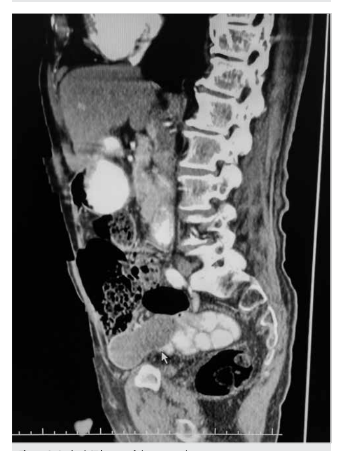
Figure 2. Sagittal CT image of the mucocele CT: abdominal tomography