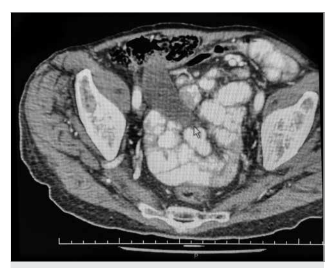
Figure 1. Axial CT image of the mucocele CT: abdominal tomography