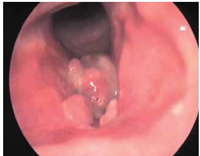
Figure 1. Granulation tissue involving the anterior commissure region following transoral laser microsurgery

The involvement of the A-com was present in 13 (22%) of the patients. The distribution of T stages of A-com involvement is given in Table 1. During the follow-up period, in 8 of these patients, granulation tissue or synechia developed at the anterior part of the larynx. Second look operation was performed for these patients and the granulation tissue (Figure 1) or the synechia was removed with the help of the diode laser. Two of the patients with granulation tissue were demonstrated to have local recurrence on histopathological examination, but the margins were free of tumor following second look operation and they were taken on a