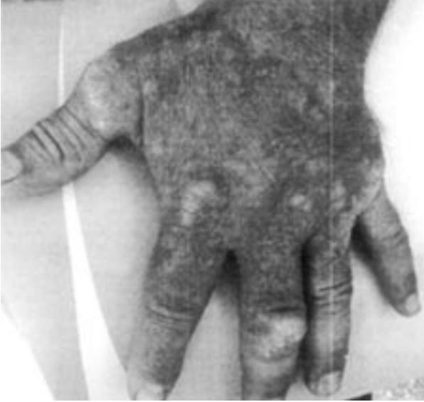
Figure 1: An annular , verrucous borders , violaceous plaque on dorsum of the left hand .

Bactec Middlebrook media from biopsy specimens. PPD test was positive. Chest X-ray was normal. Bacillus Koch (BK) in mucus was negative. Systemic examination was normal. Routine laboratory investigations were normal. After 2 monthly therapy with doxycycline (200 mg/day) improved the lesions dramatically.