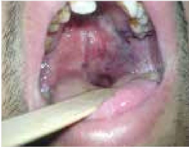
Figure 1. Intraoral view of the lesion in the left palatal region