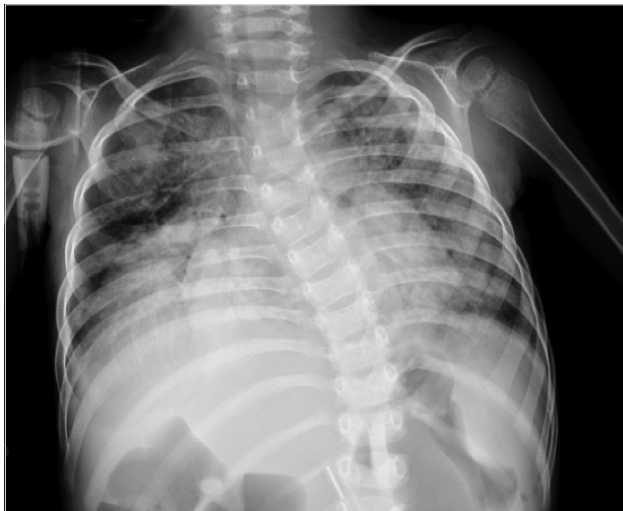
Figure 1. Chest X-ray on admission

Bronchoalveolar lavage fluid was negative for acid-fast bacilli. Ventilator parameters were set to positive end-expiratory pressure (PEEP) of 10 cmH 2 O, positive inspiratory pressure of 29 cmH 2 O, and respiratory rate of 38 bpm. The patient was intermittently switched to the prone position. Intensive respiratory physiotherapy and timely suctioning was performed. The patient was started on meropenem instead of piperacillin-tazobactam because of persistent fever. Computed tomography of the chest was in concordance with ARDS (Figure 2b). Enteral feeding was administered