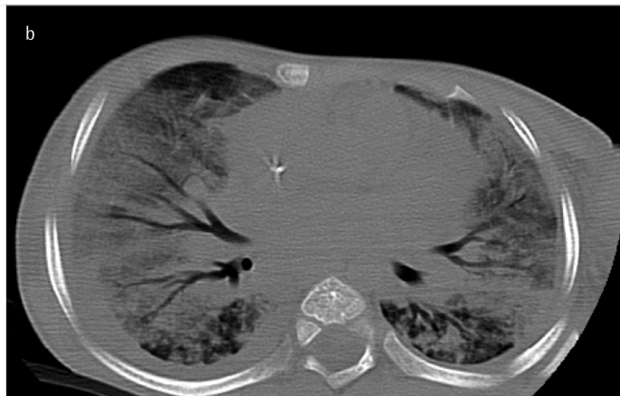
Figure 2. a, b. Results of chest X-ray (a) and chest computed tomography (b) consistent with ARDS

over percutaneous endoscopic gastrostomy tube and was gradually increased in amount. Negative fluid balance was targeted. He was administered erythrocyte suspension because of anemia. Nasopharyngeal swab sample polymerase chain reaction analysis (Fast-track Diagnostics Ltd. Malta, Qiagen, Germany) was positive for H1N1. A seven-day course of oseltamivir was administered. On the seventh day of admission, his chest X-ray showed significant improvement (Figure 3). Ventilation parameters were gradually reduced, and he was extubated on the ninth day. After extubation, respiratory physiotherapy was performed every 3 h. On the 11 th day of admission, the patient was discharged from PICU. Written informed consent was obtained from the patient's parents.